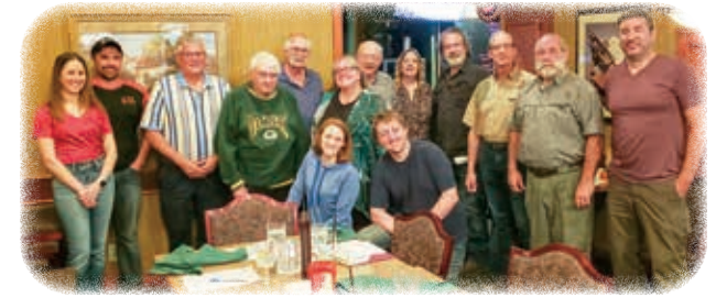
After recent elections of directors and officers, the SCI NE WI Chapter's Board of Directors represents a great combination of skills, experience, and viewpoints.

As a family we have hunted in several states (some numerous times!) and abroad in Scotland and South Africa.