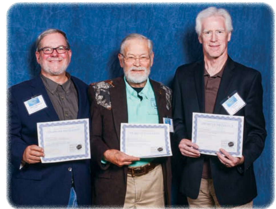
Deer Hunt Wisconsin TV special again wins Best of the Midwest Media Fest top award of excellence competing with hundreds of producers across 13 states. Sponsors include SCI WI and Badgerland Chapters.